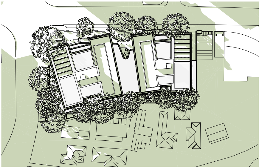
16:00pm Proposed with Trees