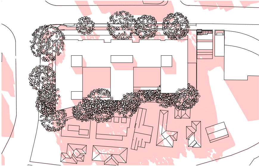
14:00pm Potential Base Scheme with Trees