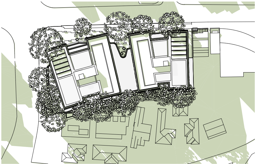
15:00pm Proposed with Trees