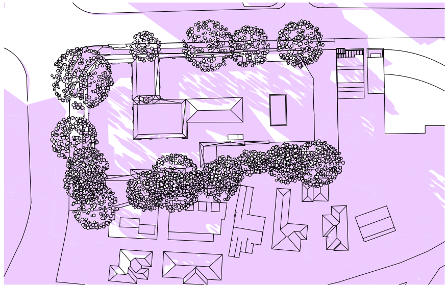
16:00pm Existing with Trees