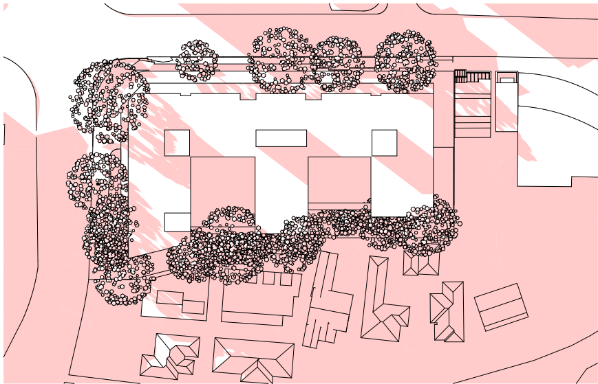
16:00pm Potential Base Scheme with Trees