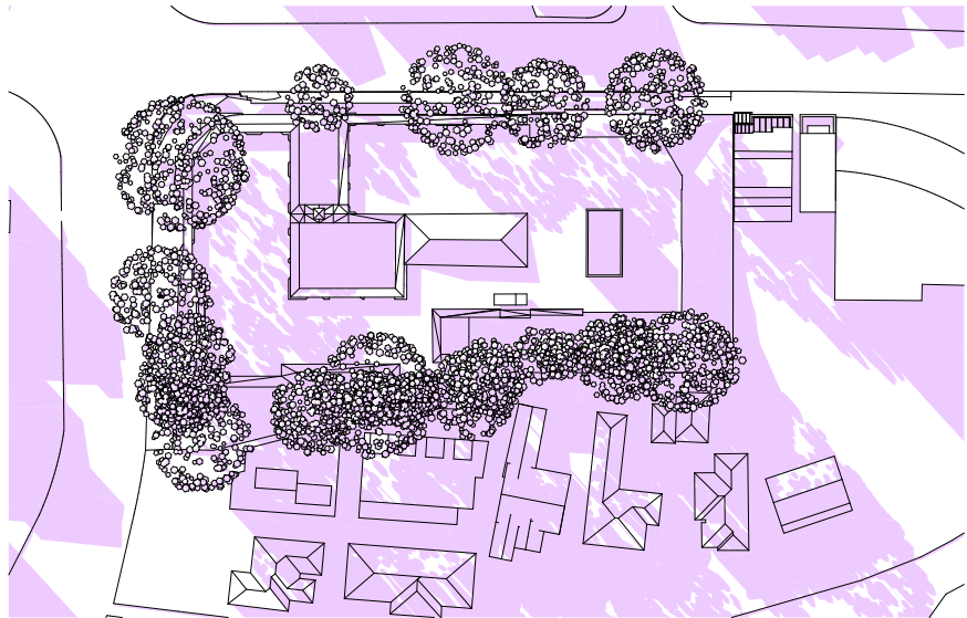
15:00pm Existing with Trees