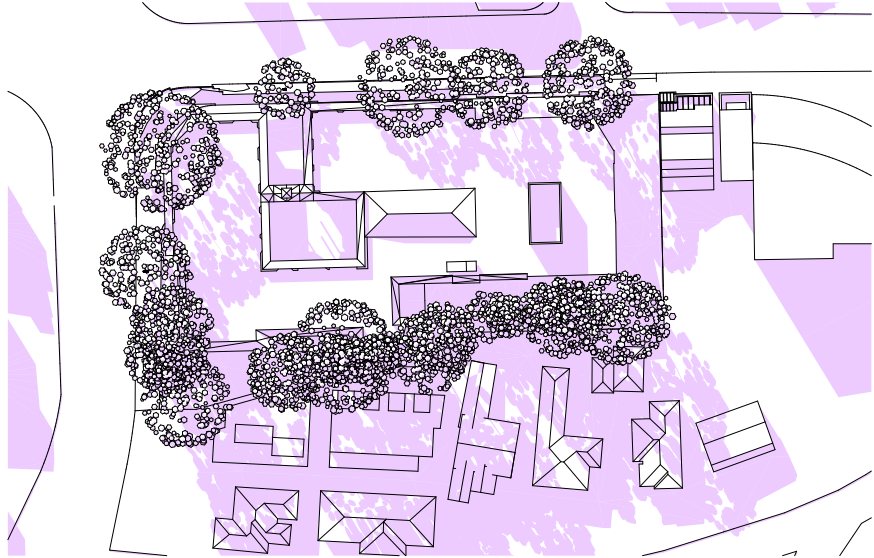
14:00pm Existing with Trees