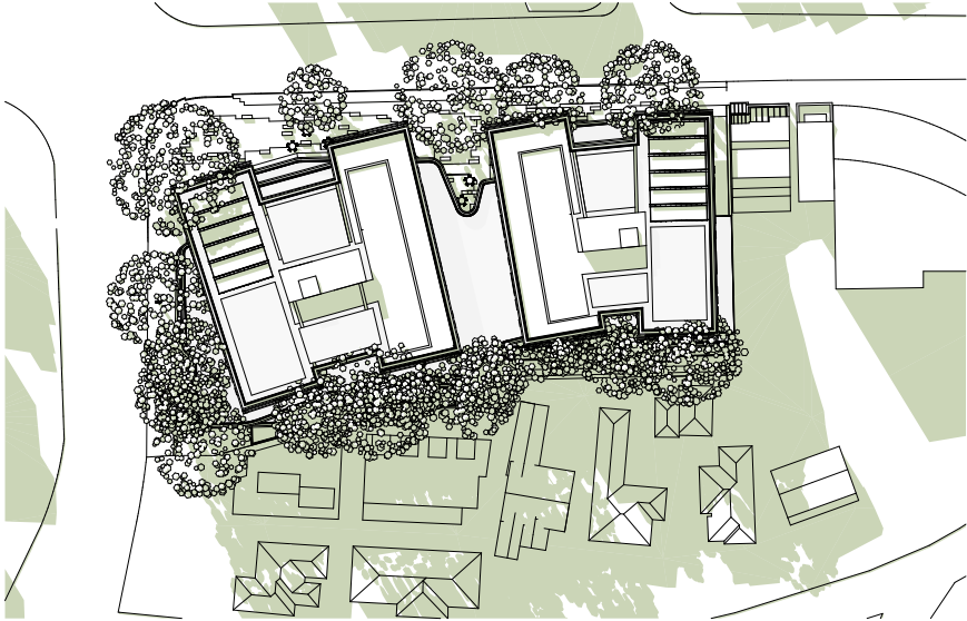
14:00pm Proposed with Trees